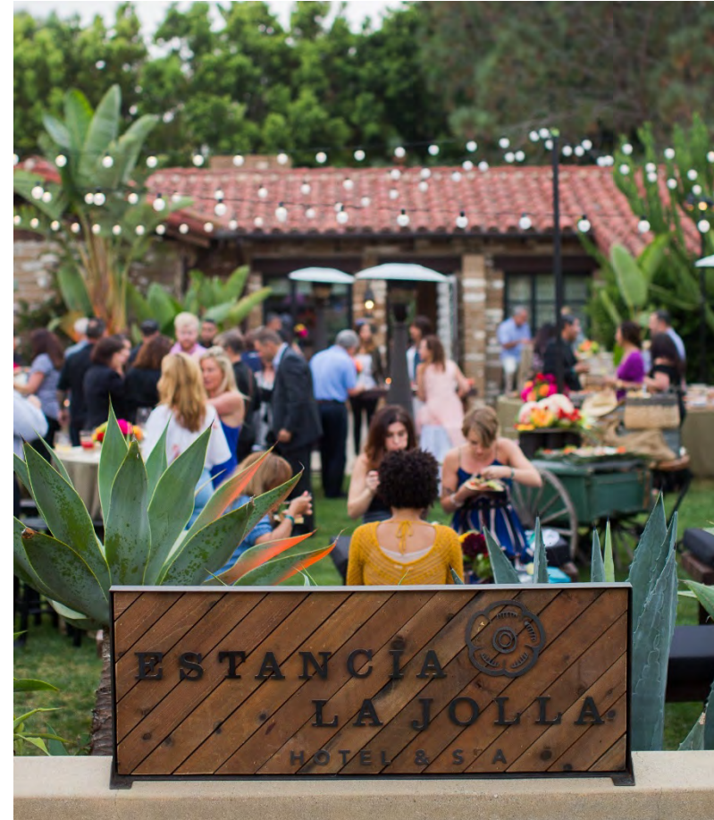
Gather in Estancia's lush gardens year-round during the Garden Party Series of outdoor culinary events.