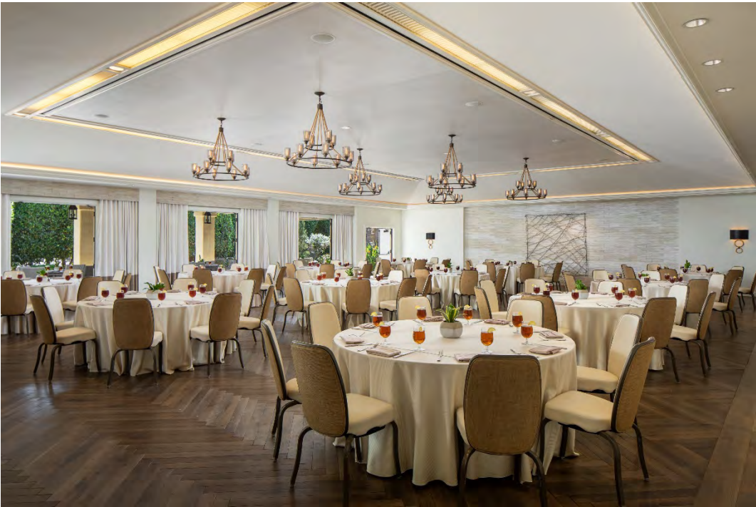
LA JOLLA BALLROOM